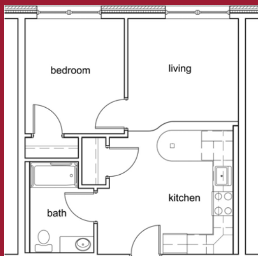
One bedroom sample floorplan

New appliances including dishwasher • Rents ranging from $650 to $925