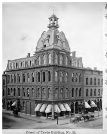
The Board of Trade Building (now home of Merrimack County Savings Bank), with its four full stories and clock tower, ca. 1885.

The Merrimack County Savings Bank occupies what was originally a four-story building that sported a convex-roofed tower at the street corner. The 90-foot tower was one of downtown Concord's most conspicuous architectural features, particularly with its illuminated clock faces and a one-ton bell cast in Sheffield, England. The building was designed by Concord architect Edward Dow for the newly formed Concord Board of Trade, the predecessor of the Greater Concord Chamber of Commerce. The Board had its office here and leased the remaining space to