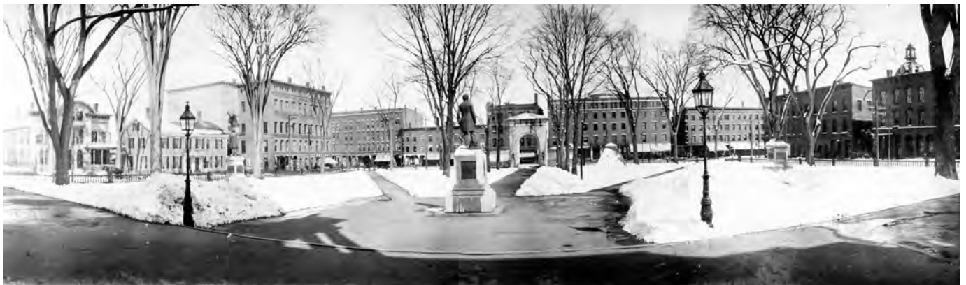
Photographed ca. 1905 and looking east from the State House brick commercial buildings that still form a continuous line along northwest corner of Park and North Main until destroyed by fire the dead of winter.

In 1866 the State House was remodeled with a mansard roof, enlarged dome, and a granite portico, all financed by the City of Concord. In 1910 the third story and west wing were added. New Hampshire has the only state capitol building whose legislature