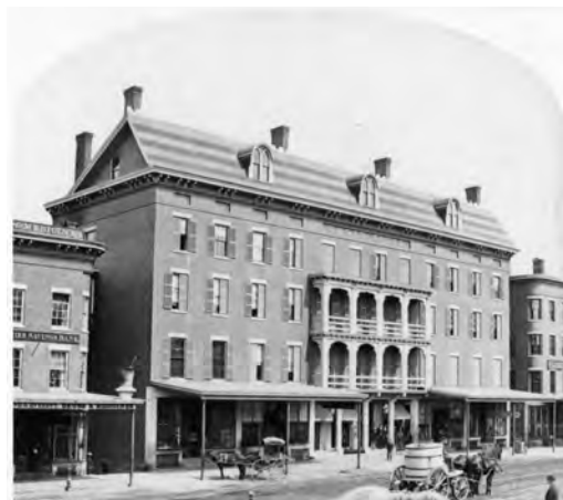
A horse-drawn water sprinkler passes in front of the Eagle Hotel ca. 1878, when it still had its pitched roof.

A downtown landmark for well over 150 years, the Eagle Hotel hosted important local gatherings and guests from all parts of the country until it closed its doors in 1961. Presidents Ulysses S. Grant, Rutherford Hayes, and Benjamin Harrison all dined here, and New Hampshire's only president, Franklin Pierce, spent the night here before departing for his inauguration in 1853. Other well-known guests included Jefferson Davis, Charles Lindbergh, Eleanor Roosevelt, Richard Nixon, and Thomas Dewey. Strategically located directly across from the State House (its name purportedly was derived from the eagle atop the State House dome), the hotel was a vital center of political activity where legislators, lobbyists, and dignitaries discussed their business. The original pitched roof was removed in 1890 and replaced with the flat fifth story seen today.