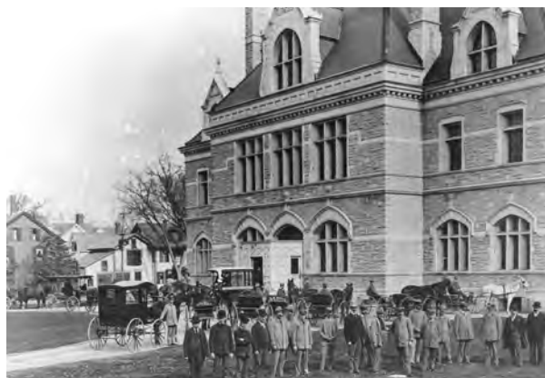
Delivery wagons pull up to Concord's imposing Post Office and Courthouse as postal employees pose for a photograph.

The earlier building is a true example of Victorian eclecticism. Gothic pointed-arched openings, Richardsonian Romanesque windows grouped in horizontal bands, carved leaf-like ornament, and a Chateausque roofline capped by finials and iron