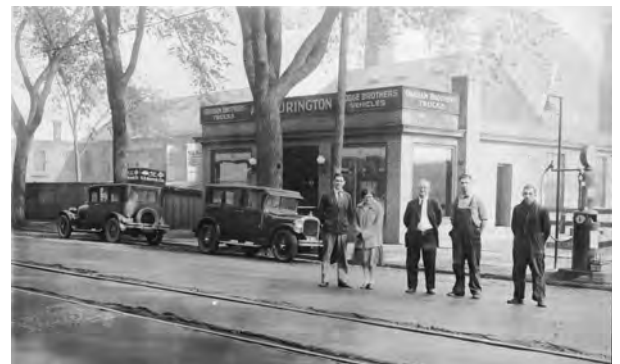
Arthur Purington's automobile garage was one of many along South Main Street in the early-mid 20 th century. It stood on the site of the Smile Building.

These two retail and office buildings continue the transformation of the east side of South Main Street from the commercial strip oriented toward automobile sales and repairs it became in the 1920s. Go into each lobby for exhibits on the history of South Main Street's evolution and the industries that were once on the site. The Greater Concord Chamber of Commerce Visitor Center is in the Smile Building.