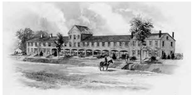
The Kimball House is shown at the far right as it appeared in the 1830s. The extended wing to the left was for a short-lived botanic hospital that offered steam baths, herbal remedies and other controversial practices.

By 1990 the theater had fallen into terrible disrepair. Resurrected as the Capitol Center for the Arts, it represents the power of a community when it comes together. More than 250 people contributed over 3,000 hours of volunteer labor and raised the money to create this non-profit, regional performing arts center.