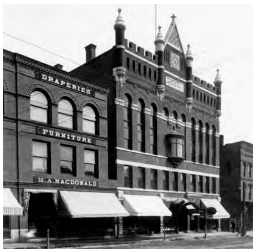
The Odd Fellows Building, showing the original crenelated parapet, tops of minarets and steep gable. Photographed ca. 1895.

The Odd Fellows Building across the street housed shops on the first floor, offices and apartments on the second, and a large meeting hall on the third used by the Odd Fellows fraternal organization. The façade, one of the most distinctive in the city, features pressed brick and storefronts with brick piers and granite caps. A copper-roofed oriel window with curved glass is located above the second story. The elongated arched windows on the third story reflect the meeting hall within. The building is crowned with an arcaded cornice that originally had a crenelated roof parapet with projecting minarets (the bases remain) and steep decorative gable.