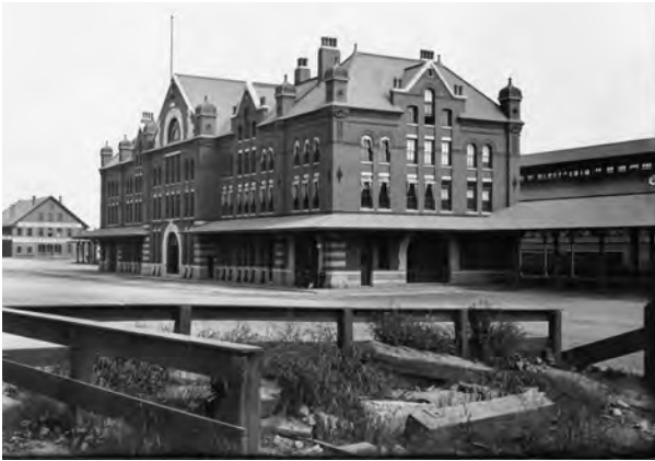
Concord's railroad station was one of the largest and grandest buildings in northern New England.

Depot Street, which also led to Railroad Square, and the various warehouses behind many Main Street buildings, remind us that this was a hub of railroad activity.