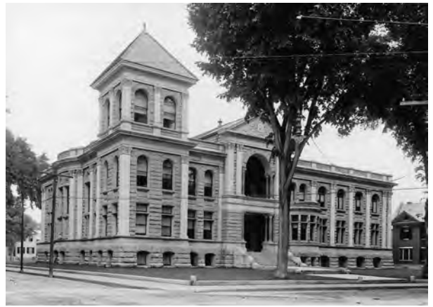
NH State Library, ca. 1940, with its corner tower intact.

⋮ Don’t miss the row of square tiles on the lawn that identify each party’s winner in the New Hampshire primary since 1952. ⋮