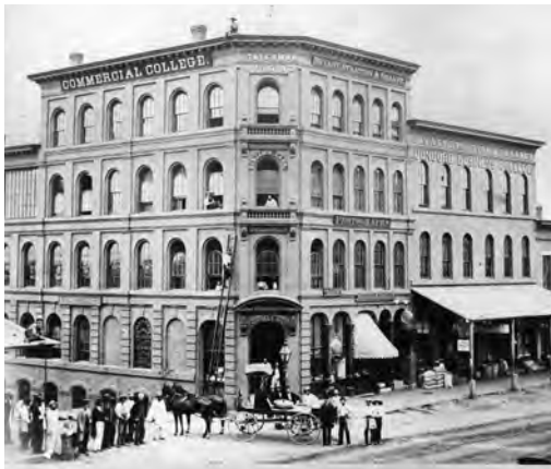
Installing lightning conductors on the Statesman Building, ca. 1901.

Arched windows, a truncated corner and a bracketed cornice lend interest to this distinguished building. When first built, it had balconies at the corner windows and a cast-iron arcaded storefront. The Statesman Building was the first in Concord to be lit with electricity, in 1886.