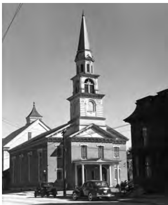
First Baptist Church, ca. mid-1940s.

surviving religious building, though it has undergone many additions and alterations. The steeple, rebuilt after the 1938 hurricane, features a bell purchased by the church in 1826 from the Revere foundry in Boston.