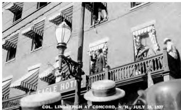
In 1927 Charles Lindbergh greeted a large crowd from the balcony of the Eagle Hotel. Lindbergh landed at the Concord Airport, at the time the state's only airport, during a national tour to promote aviation.