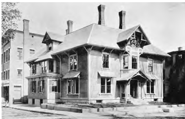
Kirkwood-Kimball House before it received its 1920s storefront.