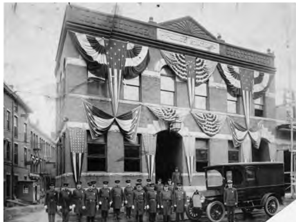
Police officers pose in front of the station decorated for Memorial Day, 1915.

built a new facility adjacent to City Hall in 1975, this building nearly met the wrecking ball. Instead, the brick and granite structure became a restaurant in which former jail cells offer intimate dining.