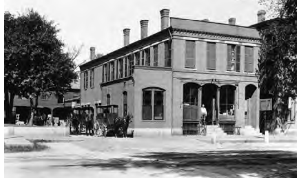
The delivery wagons lined up outside Norris' bakery were a familiar sight ca. 1898. The long building in the rear was a stable for the company's horses.

Portions of the metal framing system of the Acquilla Building are visible in the steel sign bands. The large, plate-glass windows on the second story exemplify the benefits of this new construction technique. Manchester architect William Butterfield's use of buff brick and decorative terracotta panels is a nice contrast to the red-brick and granite-trimmed buildings along the rest of Main Street.