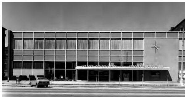
The original mid-century architectural design of Concord National Bank, photographed 1977.

The final building in the group you are viewing across Main Street, on the corner of Warren Street, is another former bank building (#11), built by Concord National Bank in 1958 when it vacated the adjacent